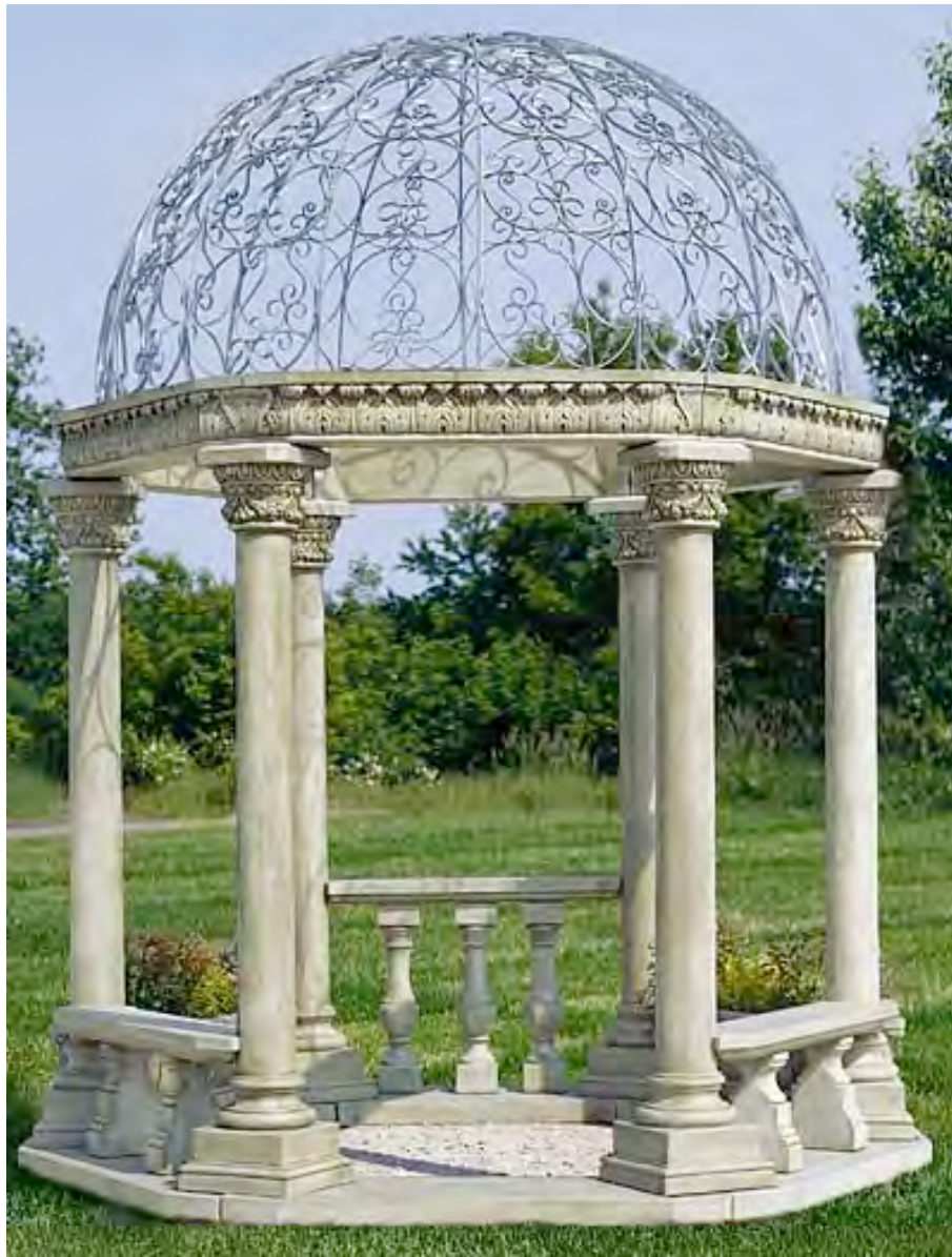
No. 2222 Basic Unit w/ Optional Inserts